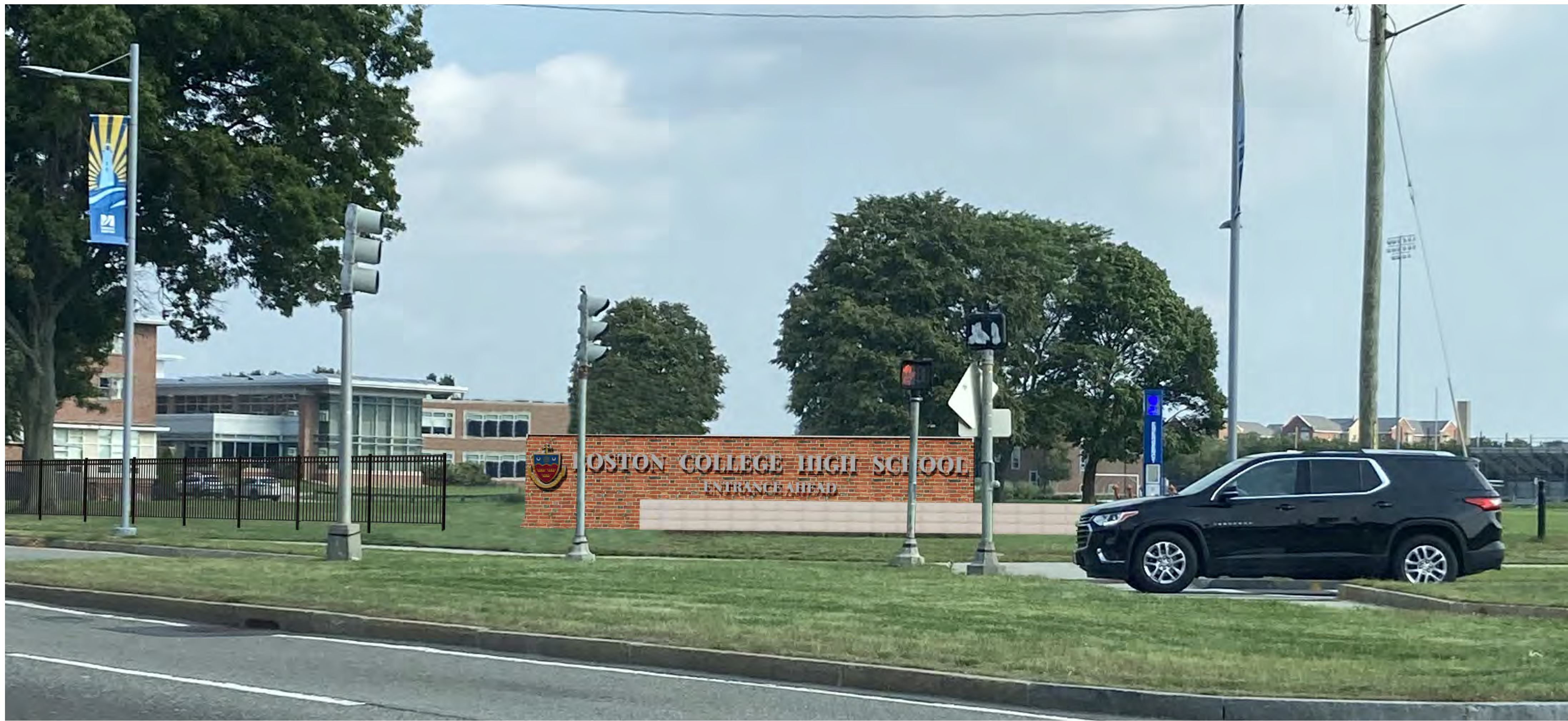
4 - SOUTH SIGNAGE WALL