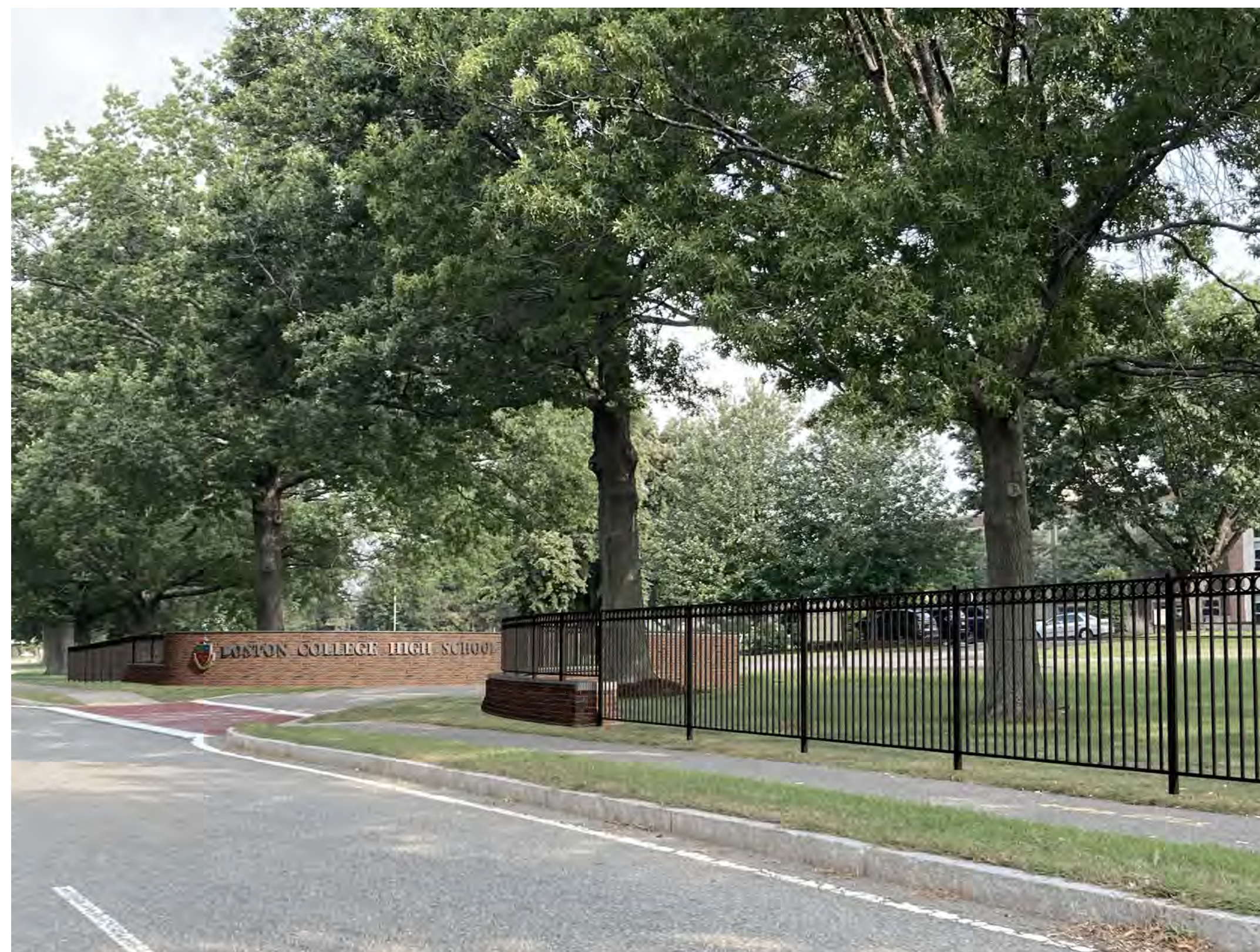
2 - MAIN ENTRY FROM SOUTH