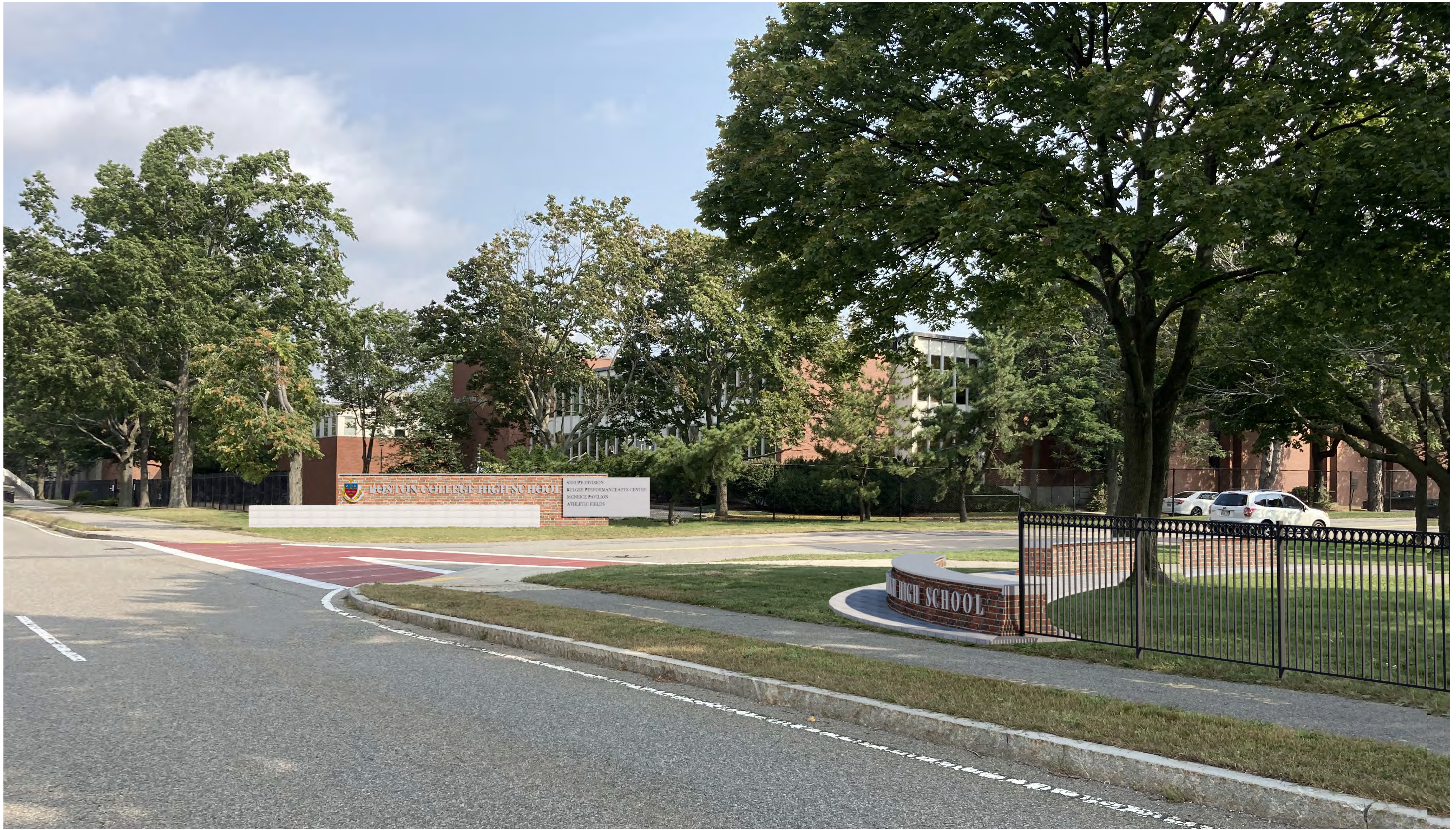
7 - NORTH ENTRY