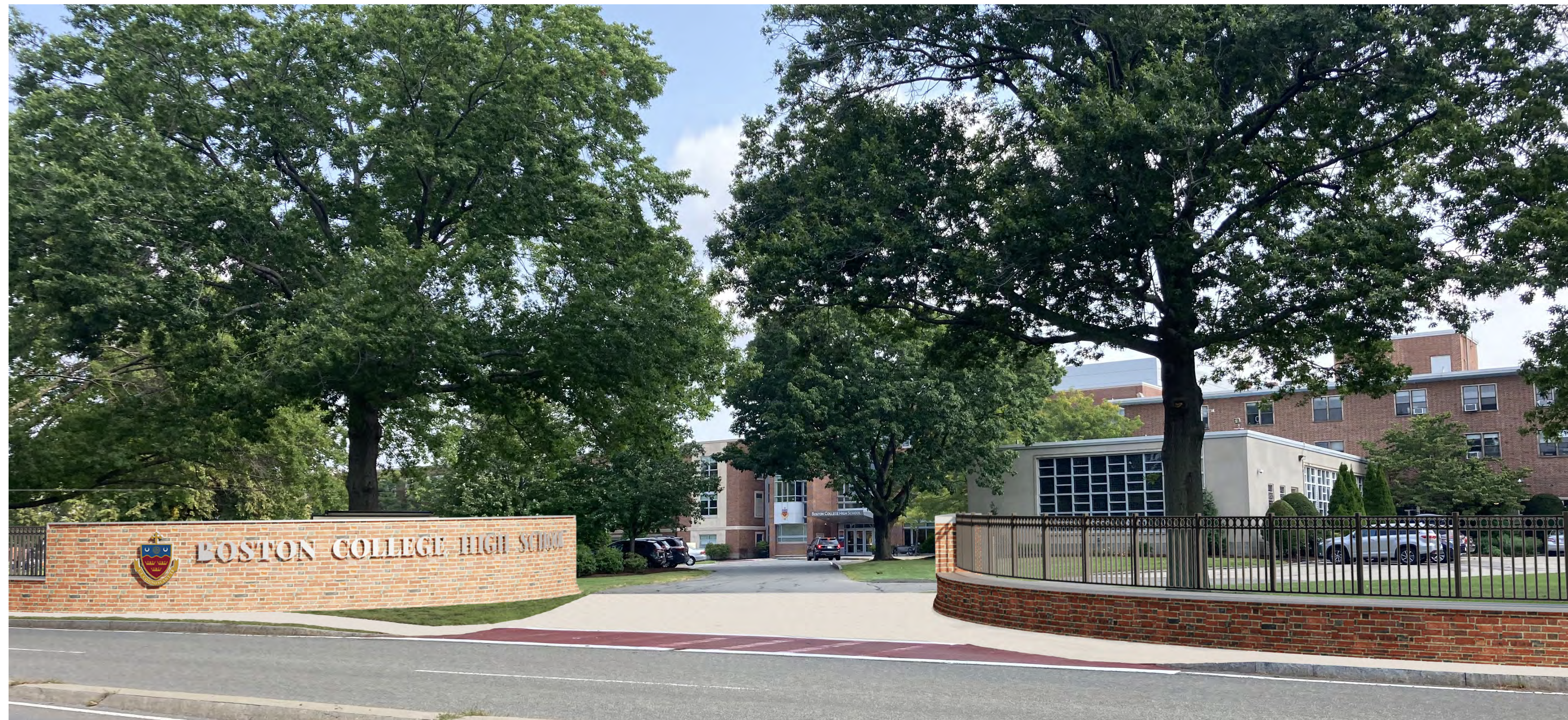
1 - MAIN ENTRY