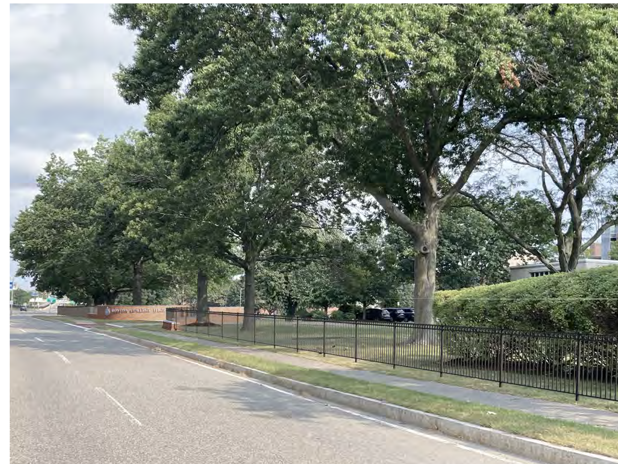
3 - MAIN ENTRY FROM SOUTH