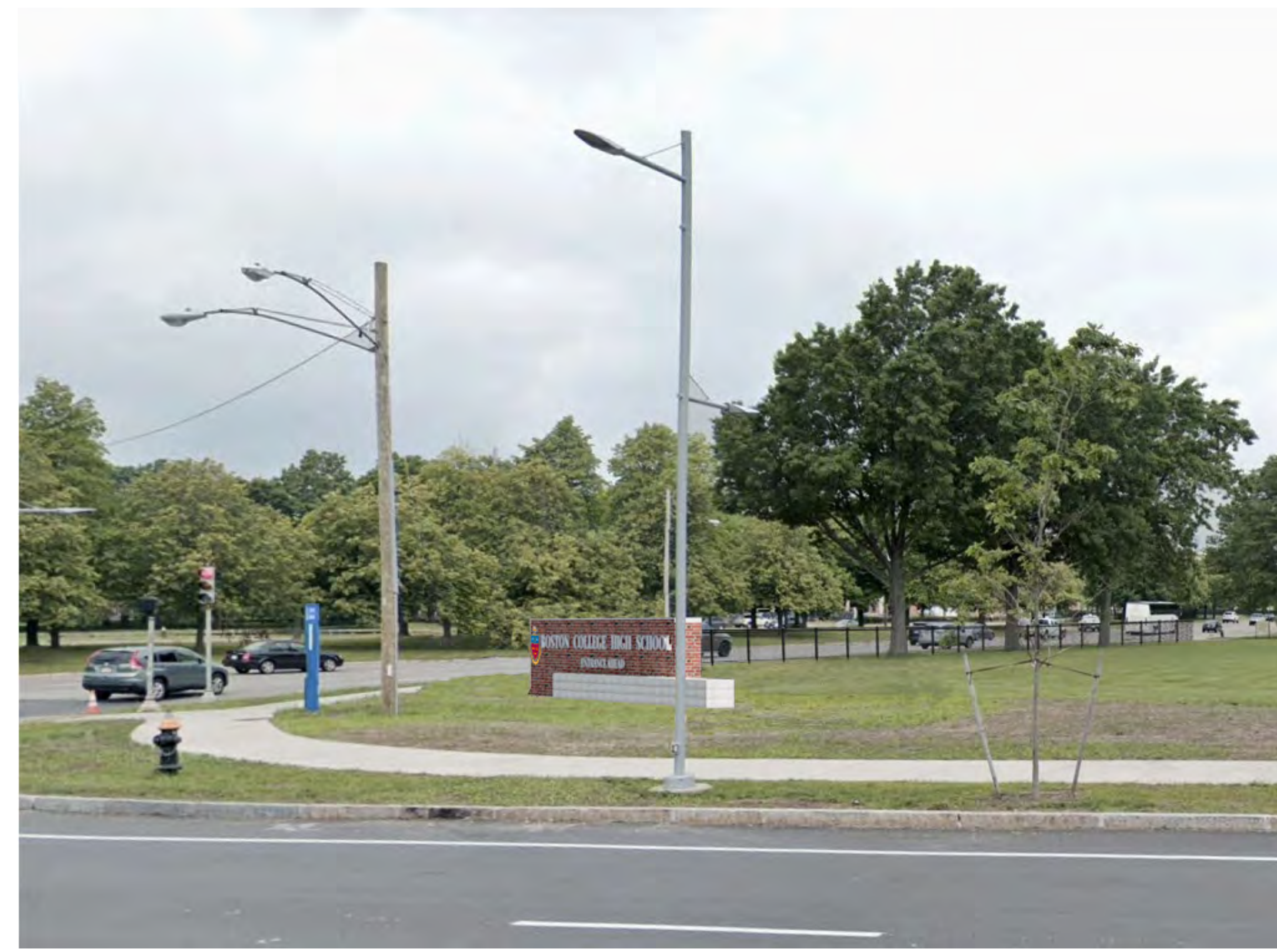
6 - SOUTH SIGNAGE WALL - FROM ACROSS BIANCULLI BLVD