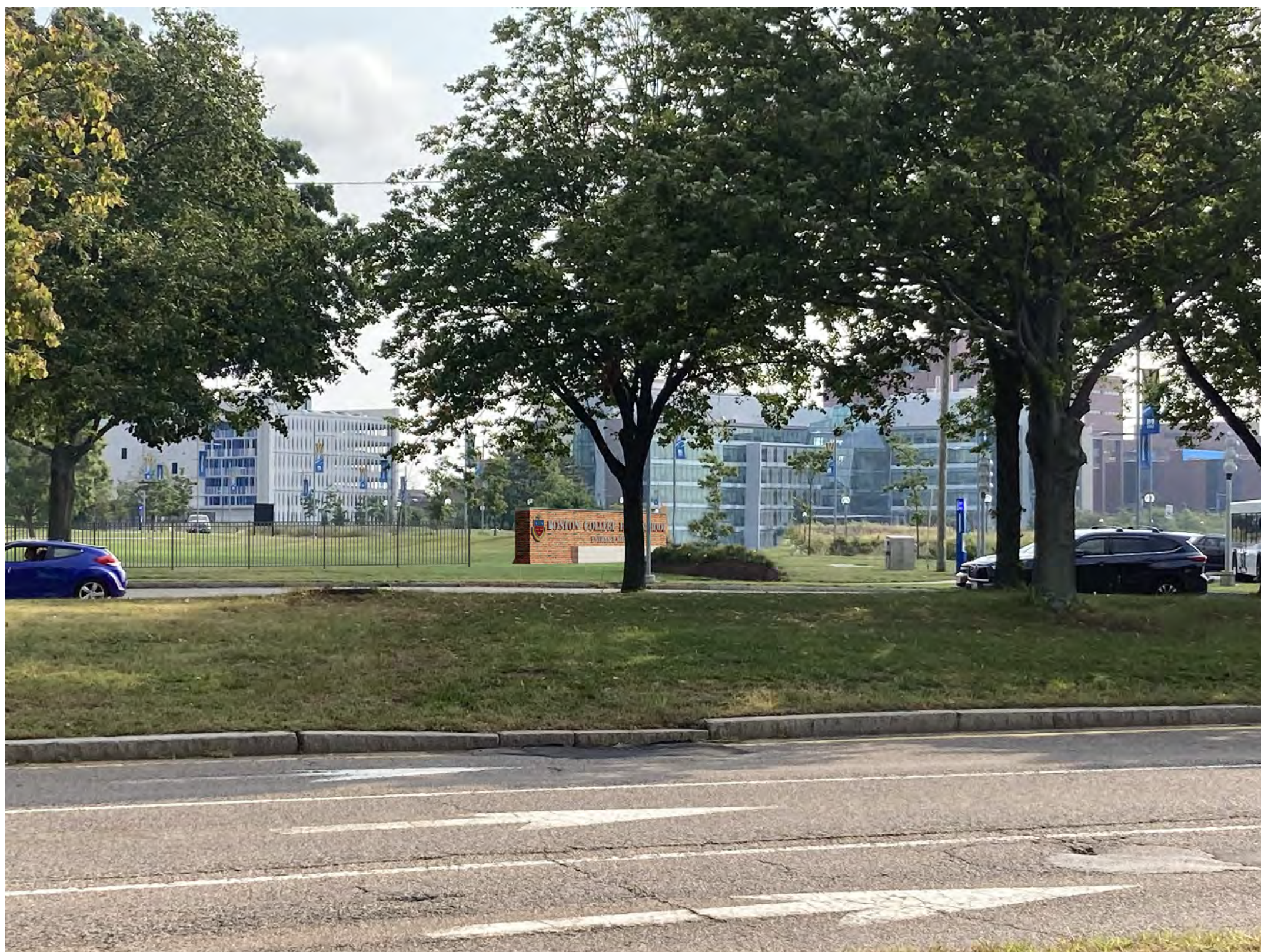
5 - SOUTH SIGNAGE WALL - FROM ACROSS MORRISSEY BLVD